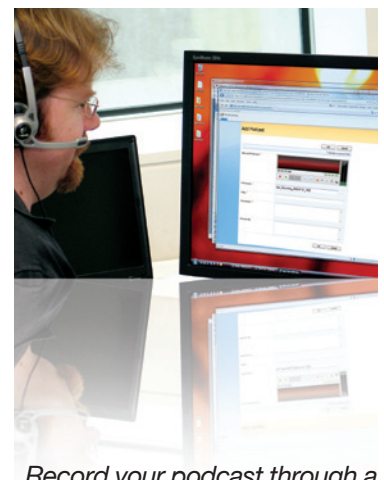
Record your podcast through a browser